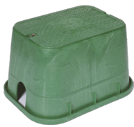
Standard & Extension