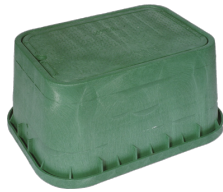
Jumbo & Extension